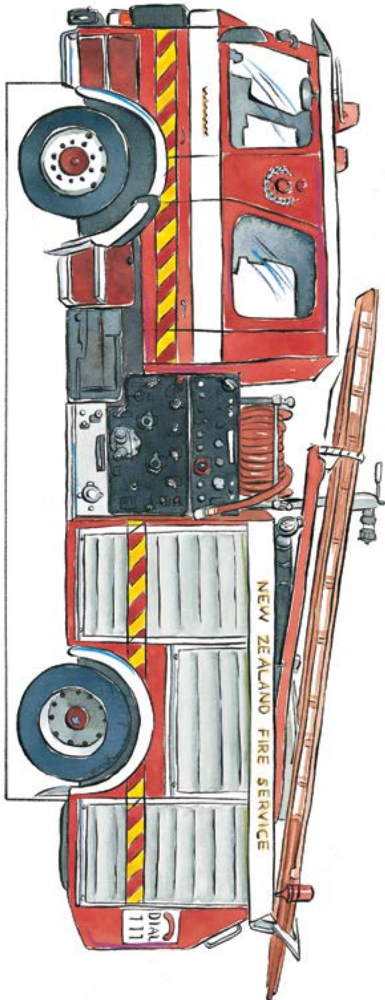
Whārangī Karetāo 4